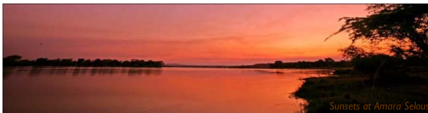
Sunsets at Amara Selous